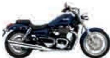
Or is Blue your thing?