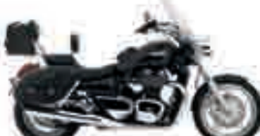
OK, let's go tour.