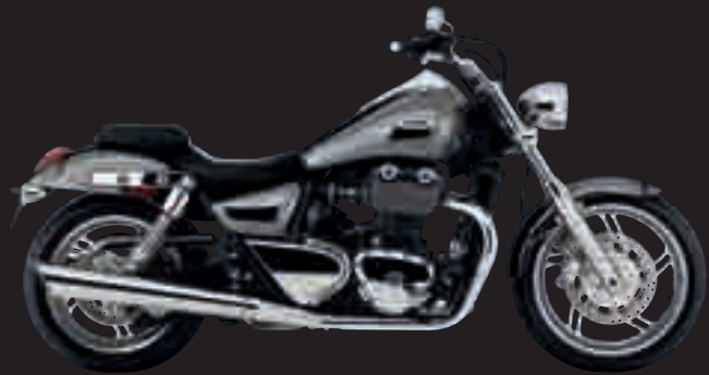
ALUMINIUM SILVER WITH JET BLACK STRIPE