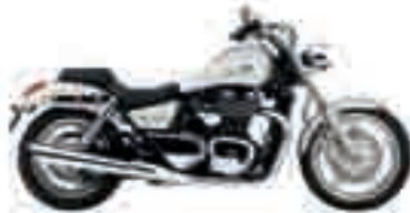
Is Silver more you?