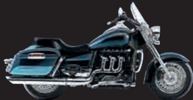
ECLIPSE AND AZURE BLUE