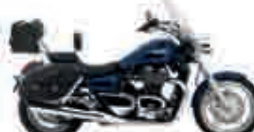
You're in Blue.