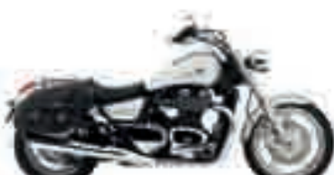
Just you, the bike and the road.