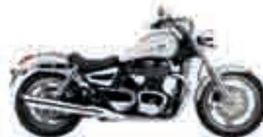
Let's add some chrome.