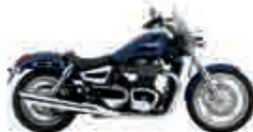
No flies on you.