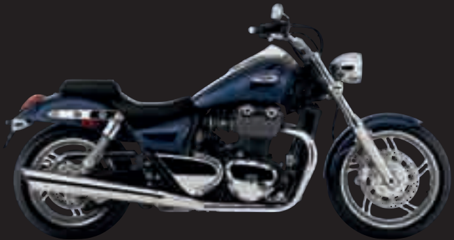
PACIFIC BLUE WITH FUSION WHITE STRIPE