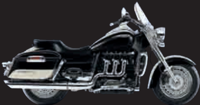
JET BLACK AND NEW ENGLAND WHITE