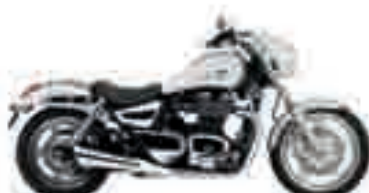
Less is more... and louder.