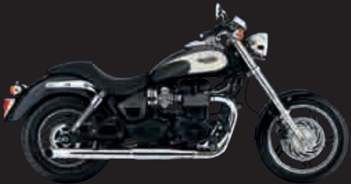
PHANTOM BLACK AND NEW ENGLAND WHITE