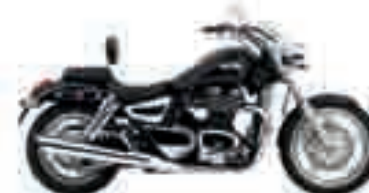
Lean back and enjoy.