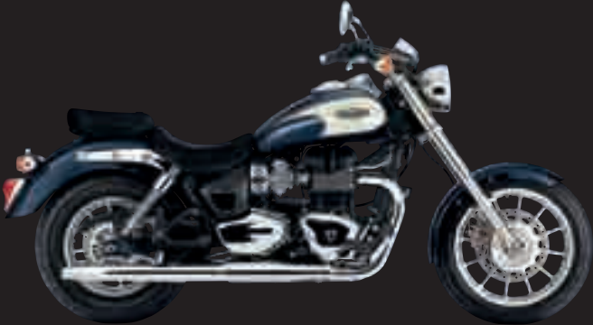
PACIFIC BLUE AND NEW ENGLAND WHITE