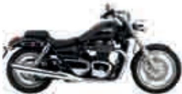
Black as it comes.