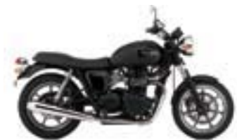
BONNEVILLE Jet Black