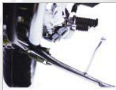
SIDE STAND - CHROME A9730019