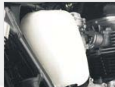
COLOURED SIDE PANEL KIT A9708077-NE - Ivory A9708077-CM - Red A9708077-FA - Yellow