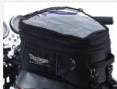
TANK BAG A9510006 Capacity - expandable up to 20 litres