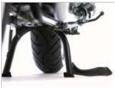
CENTRE STAND A9758013