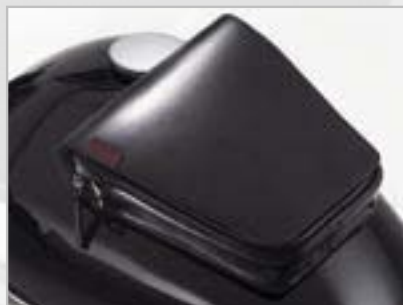
MAGNETIC TANK BAG - BLACK A9528002