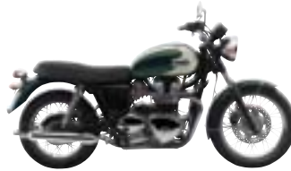
T100 Forest Green and New England White