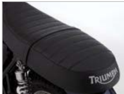
GEL COMFORT SEAT A9700246