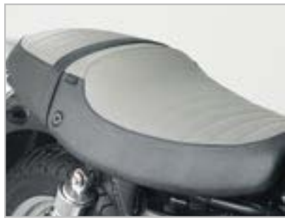
CONTEMPORARY SEAT - BLACK/GREY A9700137