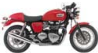
THRUXTON Tornado Red and White Stripe