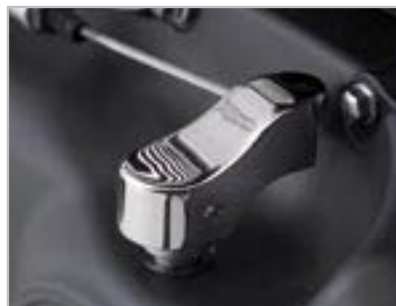
LIFTER ARM COVER - CHROME A9738075