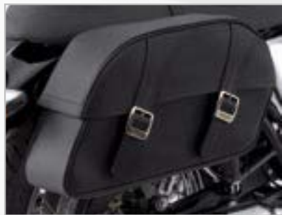
LEATHER SADDLE BAG - CLASSIC A9528028