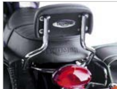
SISSY BAR LOW - CHROME A9738019 Can not be installed with King and Queen seat, A9700133