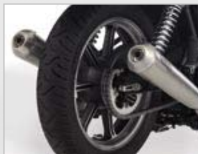
ARROW 2/2 EXHAUST SYSTEM* A9600075 E Approved (noise) EC Directive 97/24 Chapter 9