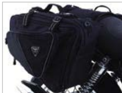
SPORTS PANNIER SET A9518013 Capacity - expandable 24 litres to 48 litres