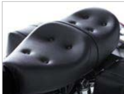
KING AND QUEEN SEAT A9700133