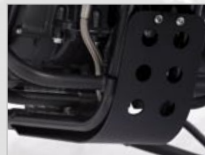
SKID PLATE - BLACK ANODISED A9708190