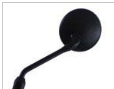
BLACK MIRROR KIT A9638012