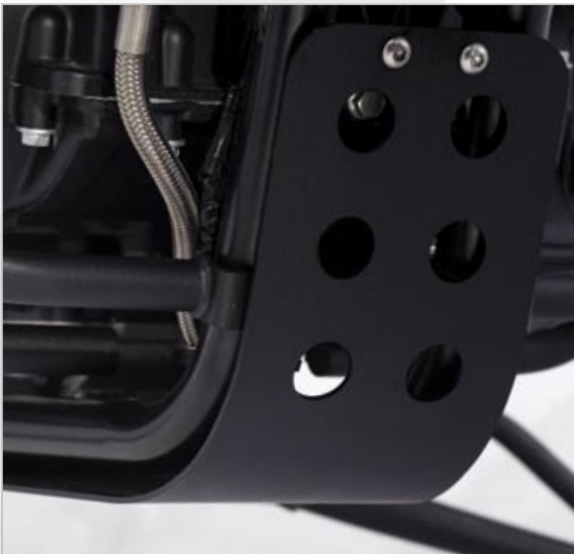
SKID PLATE - BLACK ANODISED A9708190