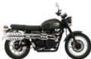
SCRAMBLER Matt Khaki Green