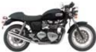
THRUXTON Jet Black and Gold Stripe