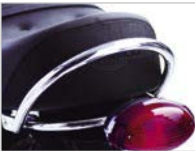
GRAB RAIL - CHROME A9738017