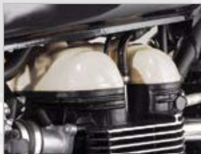
CAM COVER KIT A9618038-NE - Ivory A9618038-CM - Red A9618038-FA - Yellow