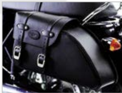
LEATHER PANNIERS - TEARDROP A9528027