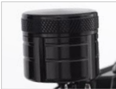
ANODISED BRAKE RESERVOIR - FRONT

Suitable for Bonneville T100 models only