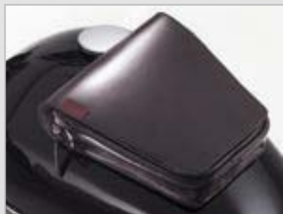
MAGNETIC TANK BAG - BROWN A9528003