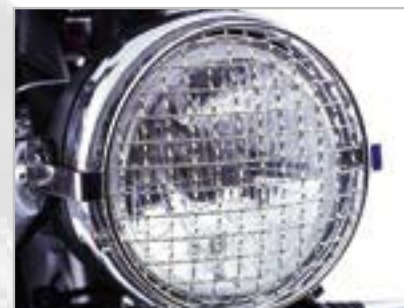
HEADLAMP GRILLE A9758024