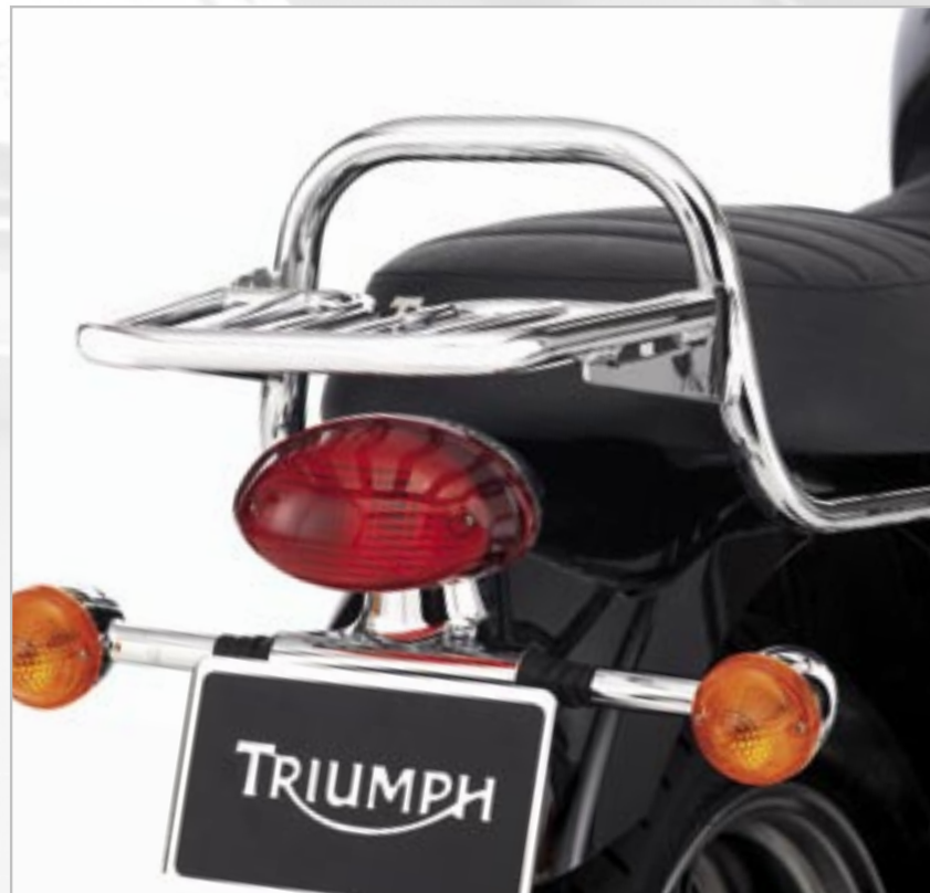
LUGGAGE RACK - CHROME A9738191 Vin specific product, please consult your authorised Triumph dealer