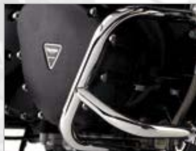
ENGINE DRESSER BARS - CHROME A9758015