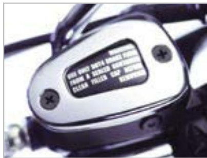
BRAKE MASTER CYLINDER CAP - CHROME