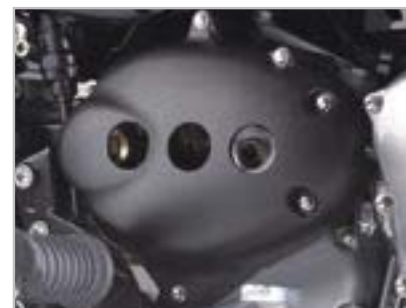
DRILLED SPROCKET COVER - BLACK A9618085