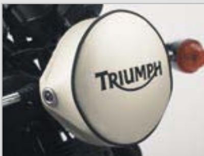
HEADLAMP COVER KIT A9708107 - Ivory A9708105 - Red A9708106 - Yellow