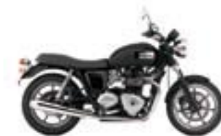
BONNEVILLE SE Jet Black