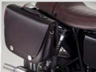
LEATHER CITY BAG A9528023 - Brown Pair A9528024 - Brown LH A9528025 - Brown RH