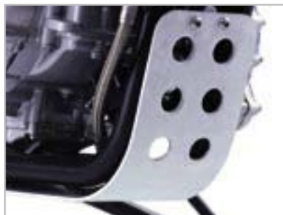
SKID PLATE - CLEAR ANODISED A9708044