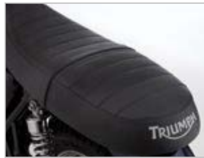
ALCANTARA SEAT - BLACK A9701208 Complete with Rain Cover