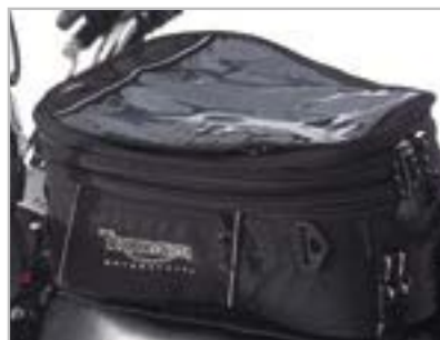
TANK BAG A9510006 Cannot be installed with Tacho Kit, A9938001