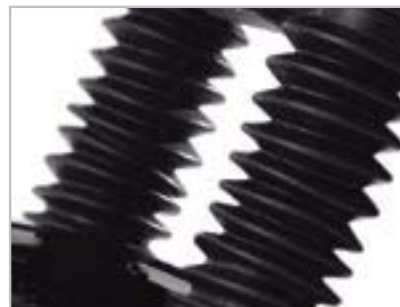
FORK GAITORS A9638018 Suitable for Bonneville & Bonneville SE models only