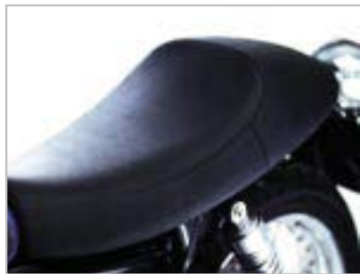
SINGLE SEAT A9700134