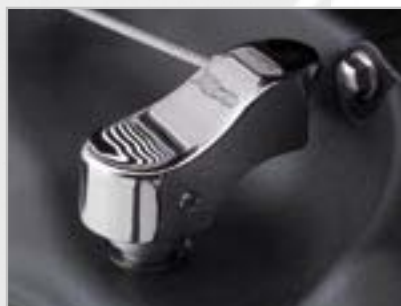
LIFTER ARM COVER - CHROME A9738075