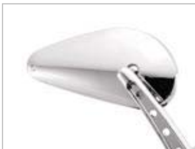
TEARDROP STYLE MIRRORS