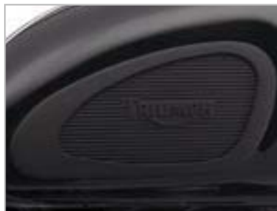
KNEE PADS A9718009