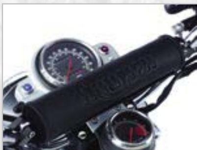
HANDLEBAR BRACE A9638008