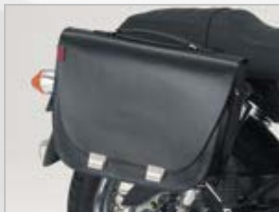
LEATHER CITY BAG A9528020 - Black Pair A9528021 - Black LH A9528022 - Black RH