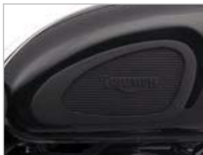
KNEE PADS A9718009