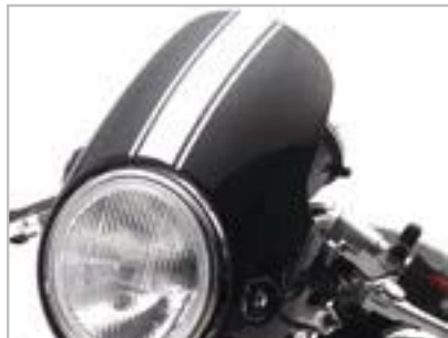
FLY SCREEN KIT A9748069-## - White Stripe A9748070-## - Red Stripe A9748071-## - Gold Stripe