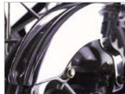
CHAIN GUARD - CHROME A9738035