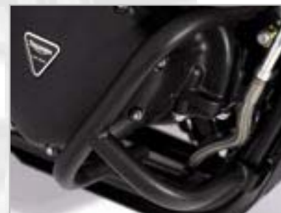
ENGINE DRESSER BARS - BLACK A9758025