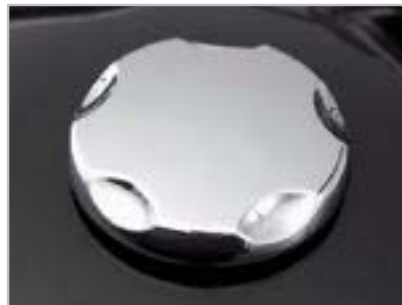
FUEL FILLER CAP - BILLET STYLE A9730176