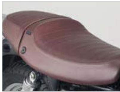
CONTEMPORARY SEAT - BROWN A9700138