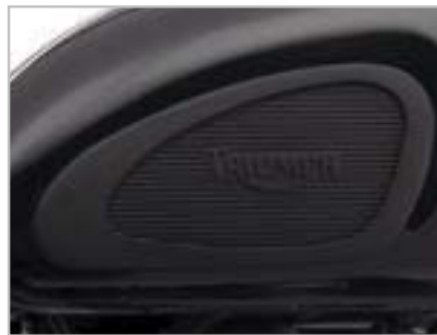
KNEE PADS A9718009