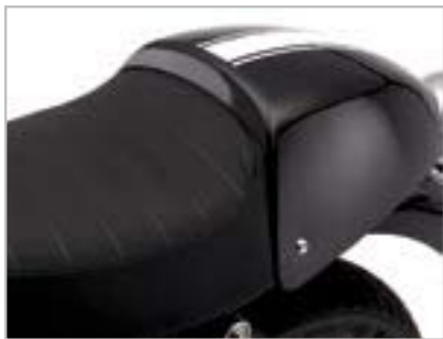
GEL SEAT DUAL TOURING A9700135