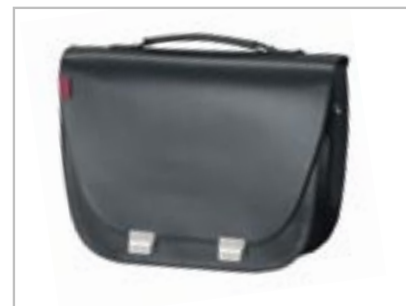
LEATHER CITY BAG A9528021 - Black LH A9528024 - Brown LH