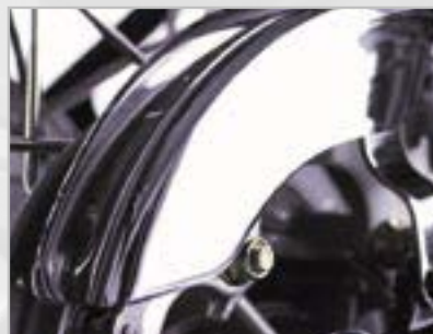
CHAIN COVER - CHROME A9738035