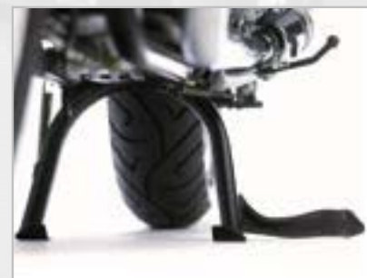
CENTRE STAND A9758100

*Please refer to the rear cover for further information