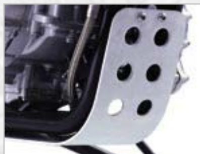
SKID PLATE - CLEAR ANODISED A9708044