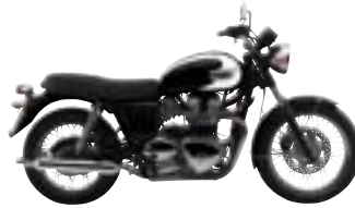
T100 Jet Black and Fusion White