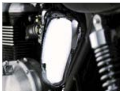
CHROME SIDE PANEL KIT