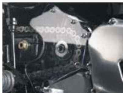
POLYCARBONATE SPROCKET COVER KIT

Suitable for Bonneville & Bonneville SE models only