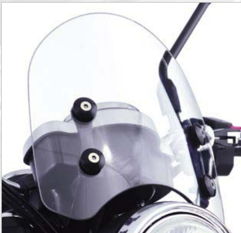
FLY SCREEN CLEAR A9708049