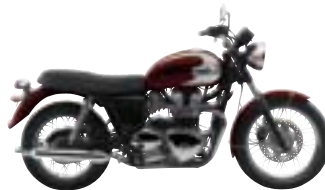
T100 Claret and Aluminium Silver