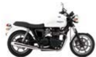
BONNEVILLE Fusion White