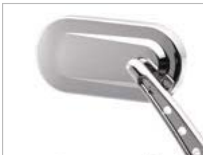
OVAL STYLE MIRRORS