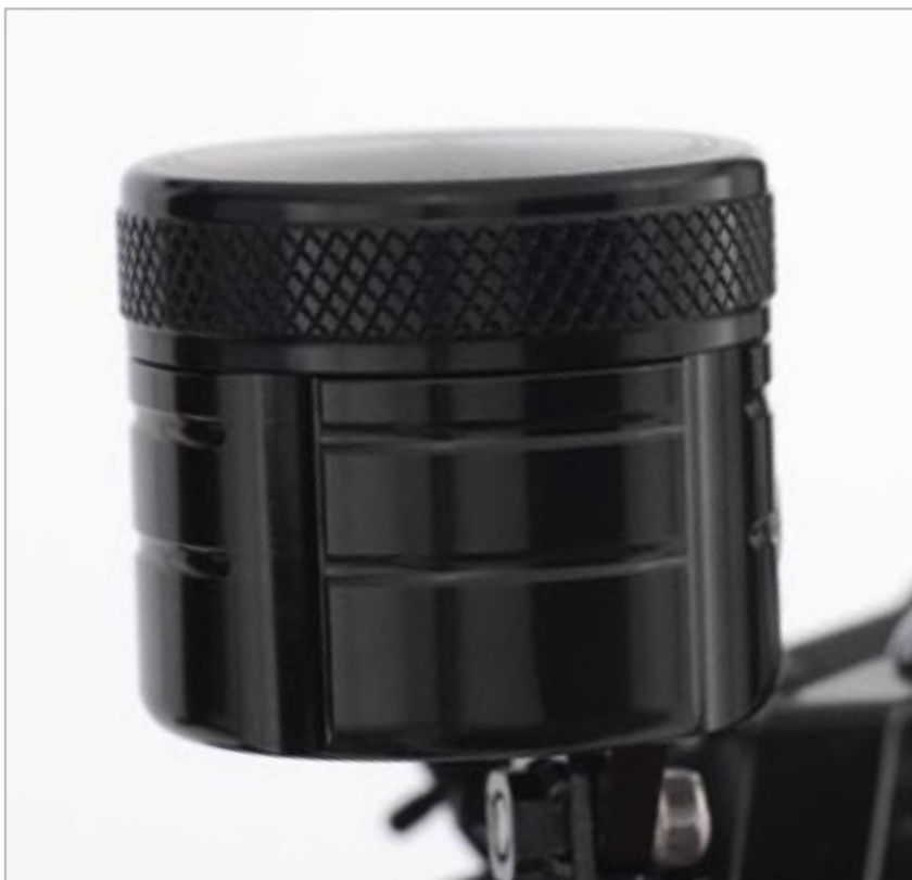
ANODISED BRAKE RESERVOIR - FRONT A9628016