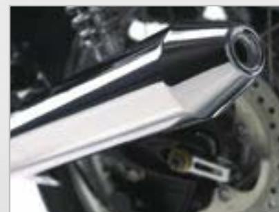
ACCESSORY SILENCER KIT* A9608070