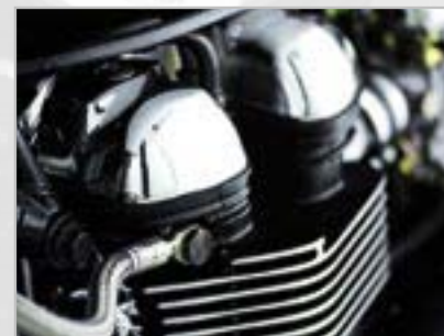
CAM COVER - CHROME A9738034