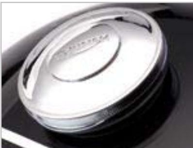
FUEL FILLER CAP, LOCKABLE A9930170