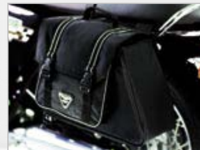
FABRIC PANNIERS A9518025 Capacity - 12 litres per pannier