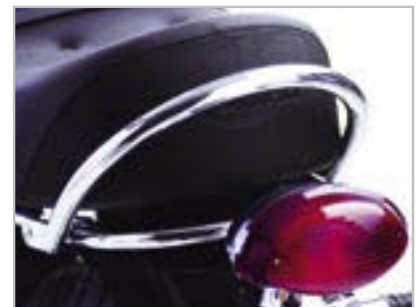
GRAB RAIL A9738017