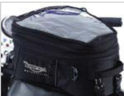
TANK BAG A9510006 Capacity - 12 litres per pannier