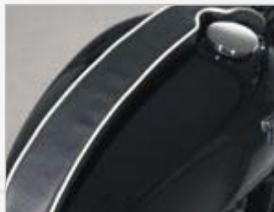
TANK PAD KIT A9708104 - Ivory A9708102 - Red A9708103 - Yellow