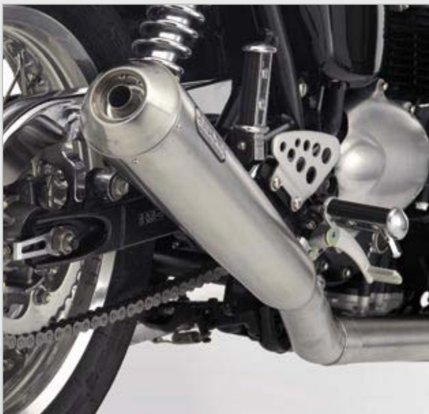
ARROW 2/1 EXHAUST SYSTEM* A9600053 E Approved (noise) EC Directive 97/24 Chapter 9