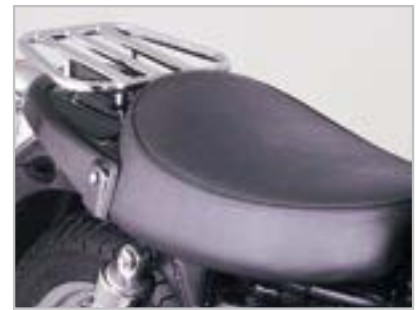
SINGLE SEAT AND RACK KIT A9708097