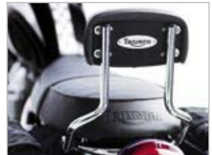
SISSY BAR HIGH - CHROME A9738018