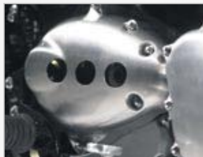
DRILLED SPROCKET COVER - CHROME A9738160