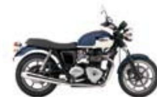
BONNEVILLE SE Pacific Blue and Fusion White