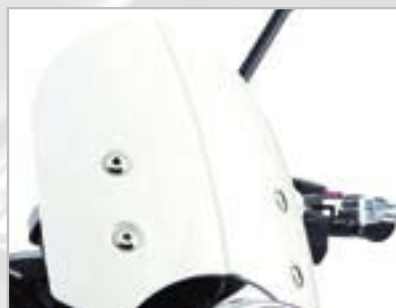
FLY SCREEN - COLOUR COORDINATED A9708027-##