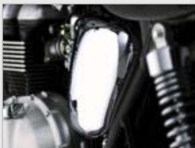
SIDE PANEL - CHROME A9738060