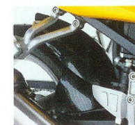
Rear Hugger A9748019