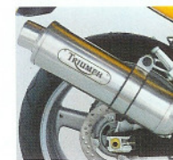
Silencer – Stainless Steel* A9601016