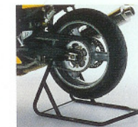
Paddock Stand A9758010