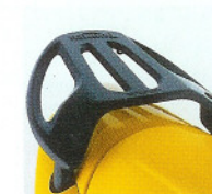
Top Rack A9758018