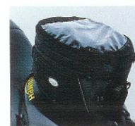
Tank Bag A9510023