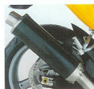
Silencer – Carbon Fibre Wrap* A9601009