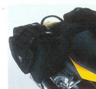
Sports Throw-over Panniers (includes Panel Protectors) A9518011