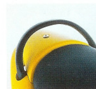
Grab Rail A9758020