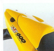
Seat Cowl A9708031 + colour