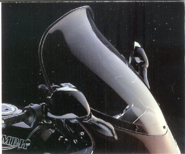
Right, High Screen (Polycarbonate) - a genuine Triumph accessory

Which Motorcycle?: "The new Trophy has recaptured the power and balance of the original bike, and added to the formula a much greater degree of style, individuality and quality of finish." and Bike Magazine's Phil West... "Predictably that (900) water-cooled DOHC 12-valve motor was just as gutsy and generally brilliant as ever. Its crisp carburation and stacks of low-rev and mid-range torque made for instant urge given a tweak of the throttle..."