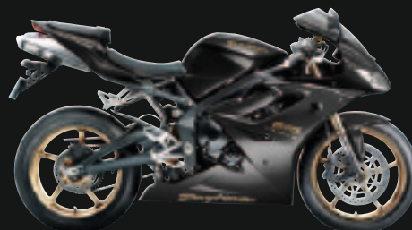
DAYTONA 675 PHANTOM BLACK