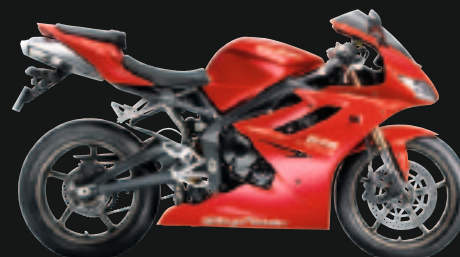
DAYTONA 675 DIABOLO RED