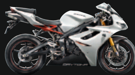
DAYTONA 675 CRYSTAL WHITE