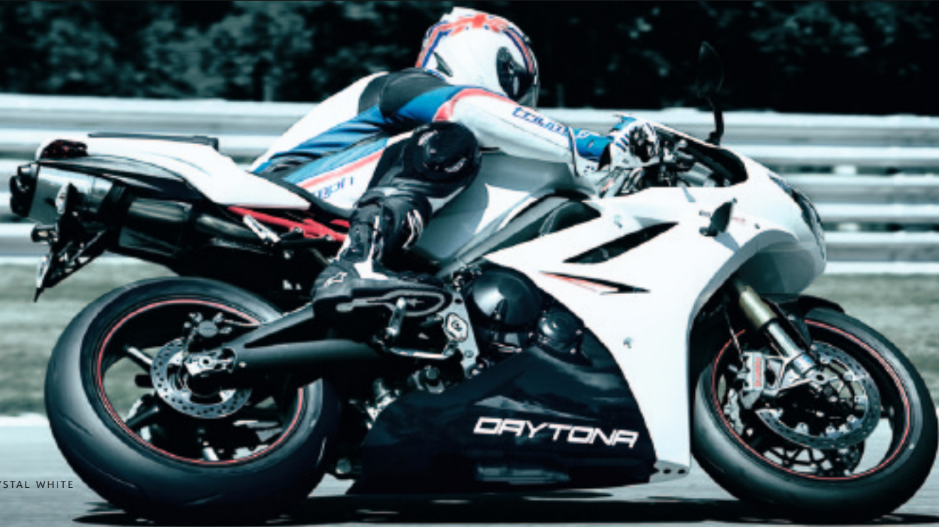
DAYTONA 675R CRYSTAL WHITE