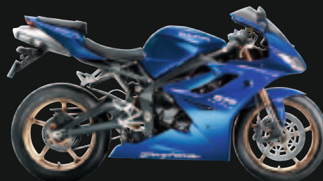
DAYTONA 675 CASPIAN BLUE

Facts and figures in silver are bespoke to the 675R Model Only